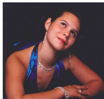
Figure 2. Post-treatment photograph of the patient.

On April 12, 2000, after 5 months of ANP therapy, follow-up brain MRI revealed the sum of the volumes of the three target lesions to be 4.32 cm 2 a decrease of 73.8% from baseline, indicating a PR had been achieved. On June 25, 2003, follow-up brain MRI revealed no remaining enhancing disease indicating a CR had been achieved (Figure 1). Repeat brain MRI on April 28, 2022, demonstrated the persistent absence of disease (Figure 1). The patient was maintaining an excellent quality of life (Figure 2).